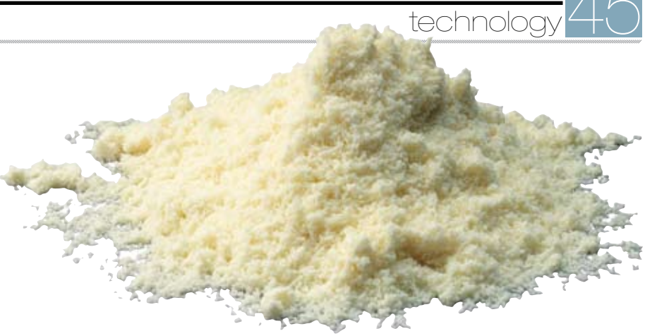
Above: Pure concentrated proteins can be stored for several years after drying

conventional, low quality protein by-products from these process streams are mainly used as animal feed because the proteins cannot be extracted by other methods or are damaged during the harsh extraction processes. The continued use of these recovery processes means that food ingredient companies are failing to exploit the valuable source of untapped revenue from their side-streams.